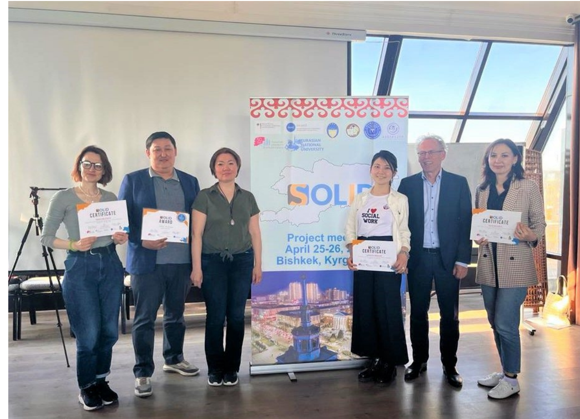
SOLID (Social work and strengthening NGOs in development cooperation to treat drug addiction) project meeting April 25-26, 2023. Bishkek, Kyrgyzstan