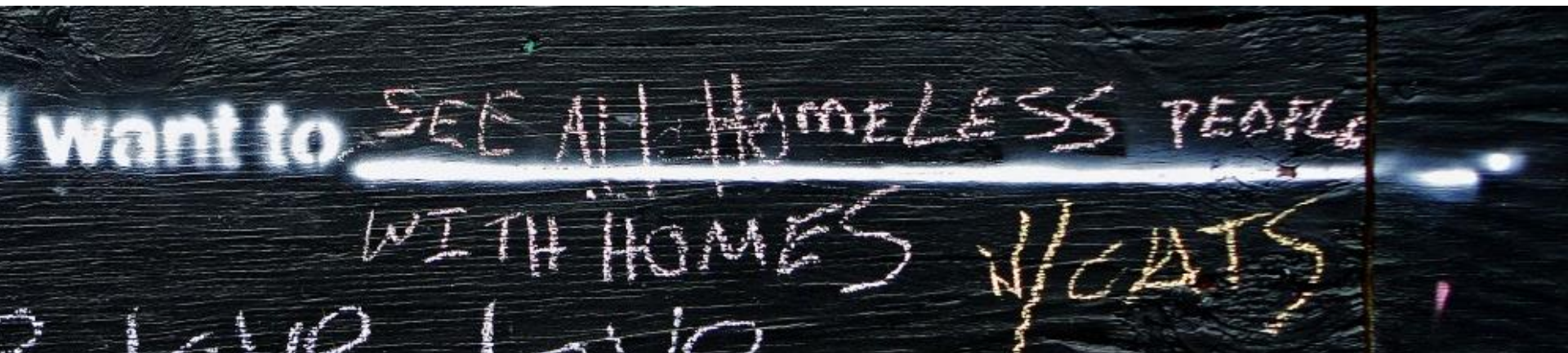
Extract of Candy Chang's campaign 'Before I die, I want to...' ( candychang.com )